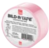
BILD-R-TAPE® construction tape is a multi-purpose construction tape assembled using an acrylic based, pressure-sensitive adhesive combined with polypropylene film.